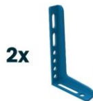
2x ANGLE BRACKET PLUS 450X250 N.015PLUS