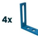
4x ANGLE BRACKET PLUS 185X175 N.012PLUS