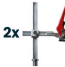
2x VARIABLE THROAT DEPTH WITH LEVER CLAMP N.001D