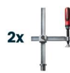
2x VARIABLE THROAT DEPTH CLAMP N.001C