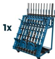
1x TOOL TROLLEY M / TOOL TROLLEY L (OPTIONS) T.012B / T.012A