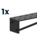
1x TABLE EXTENSION PLUS 1000X200 N.018PLUS