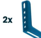
2x ANGLE BRACKET PLUS 300X190 N.014PLUS